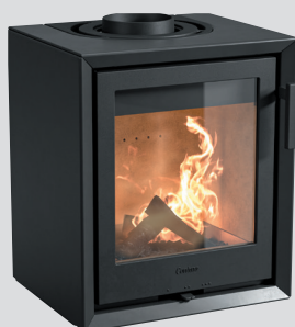
Stove, cast iron door