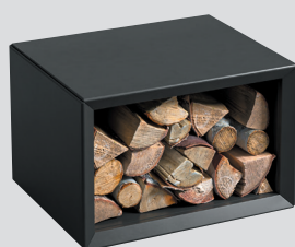
Log box, black steel