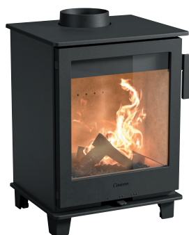
With feet, cast iron door