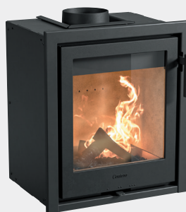
3-sided frame, cast iron door