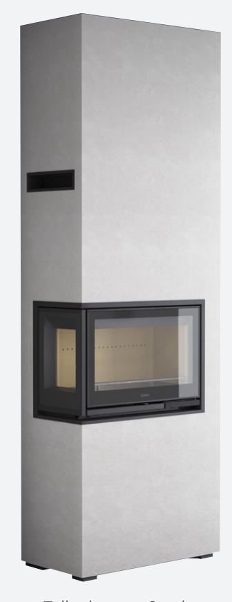
Tall, glass on 2 sides, right or left.