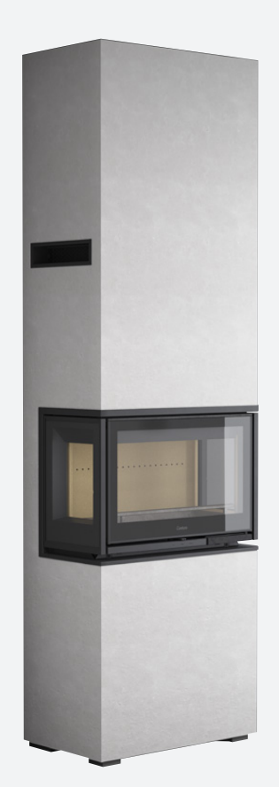
Tall, glass on 3 sides.