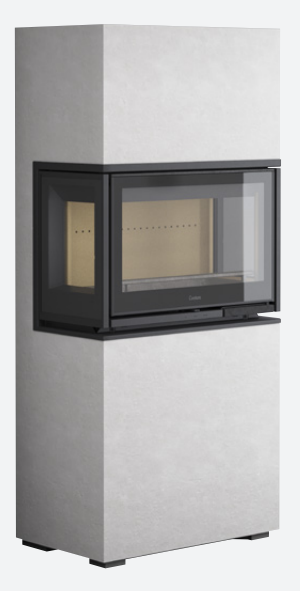
Low, glass on 3 sides.